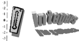
Order of Operations and Integers

learning for its ability to provide immediate feedback, self-paced learning, and individualized instruction. In her study, Wallis found that students who used computers had increased self-esteem and were more enthusiastic about school. The simulated nature of computers increases novelty, and keeps students on task with organizers such as calendars, program outlines, and graphics. Navigational aids and self-paced learning features give students independence in their learning. Finally, Wallis found that her students learned more effectively with computers because they were given many opportunities to arrive at the correct answer. Well-designed software can provide prompts after a number of attempts, or automatically move on to more challenging material.